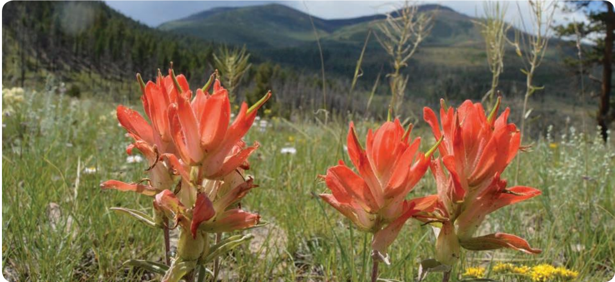
Indian paintbrush outside South Fork

Consider Pop-up Parks. Pop-up parks are temporary public spaces that allow communities to test-drive new concepts for public spaces. Examples of possible pop-up outdoor recreational activities include temporary shutting down roads to create “play streets”, movies in the park, yoga classes, boot camps, soapbox lectures and parking spots converted to mini parks. Pop-up parks require little investment and allow a community to explore which recreational activities best suit its residents and to test how these activities might energize public spaces and facilitate outdoor recreation, thereby leading to a more healthy local population.