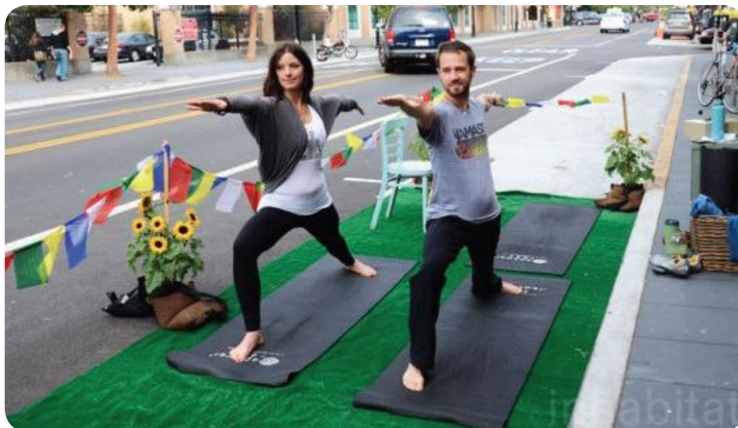
A parking space converted into a temporary park. For more examples of "pop-up" parks and "parklets" check out: http://www.pinterest.com/popuprepublic/parklets-from-pavement-to-greenspace/

Invite the Community to Tend Parks and Green Spaces. Where possible, alter the operation and maintenance of highly used outdoor places and spaces to encourage residents to assume as much of their stewardship as possible. Working with soil, planting and tending gardens are healthy outdoor activities that prompt people to nurture more of an attachment to their communities green spaces. Citizen stewardship